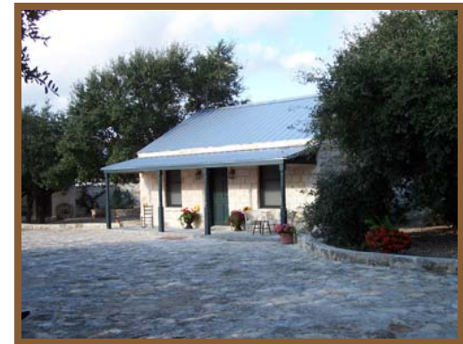
Bed & Breakfast