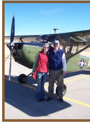
Fly into Mason County Airport