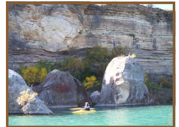
The Llano River: Kayaks and fly rods